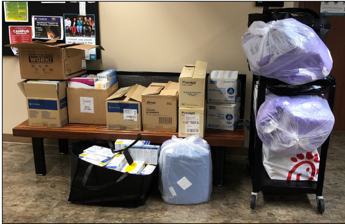
Hundreds of PPE were delivered to the Jefferson County Courthouse.