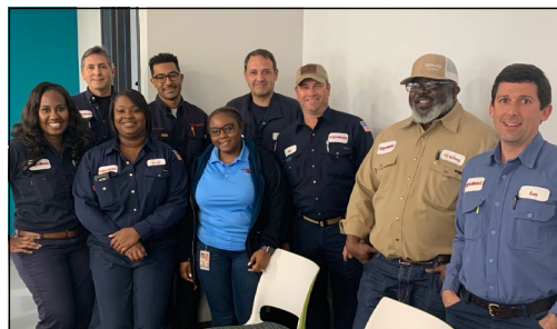
Technology students hear advice from experienced ExxonMobil employees.

open forum. The leaders discussed interview preparation, resumes, typical job expectations and responsibilities, shift schedules, work-life balance, plus other industry-related questions.