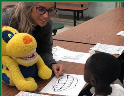
A Dental Hygiene student demonstrates how to properly brush teeth at Bingman Head Start.

LIT Dental Hygiene students recently visited BISD's Bingman Head Start Program. They taught the youngsters tooth brushing techniques, while providing exams and helpful tips to keep their smiles healthy!