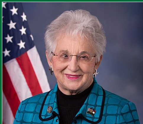
U.S. Congresswoman Virginia Foxx.