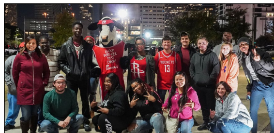
LIT students showed team pride at the Rockets game.

Nineteen students made the trip to Houston recently to attend the Rockets basketball game. LIT Game Night, sponsored by the SGA, included free transportation, tickets and a $5 meal voucher. Everyone enjoyed the game and outcome, as the Rockets won 111-102.