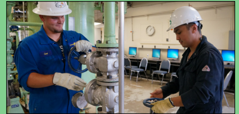
Two students are hard at work on Process Operating equipment

Representatives from ExxonMobil Refinery, Beaumont, Lamar University and BISD, along with the Hispanic Professional Women met at LIT to identify ways to help meet Southeast Texas workforce needs.