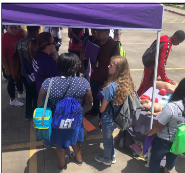
ECHS students talk to representatives from Total Medical Care.

If you were on campus in late July, you probably spotted groups of "younger" students—soon-to-be area 9th graders, and participants of our Beaumont ECHS Summer Bridge program. This is our "Innovative Academy," one of the first 18 in the state of Texas.