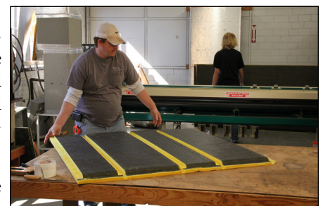
Programs such as HVAC will be highlighted.

The Marketing Department hopes this free publicity brings more recognition to these highlighted programs.