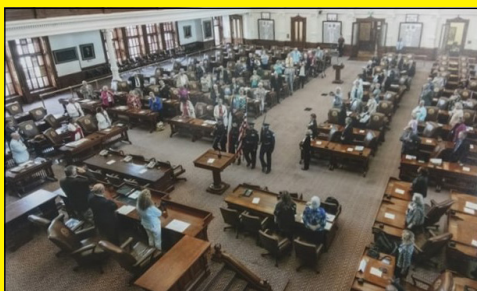
The Silver Haired Legislature delegates hard at work.