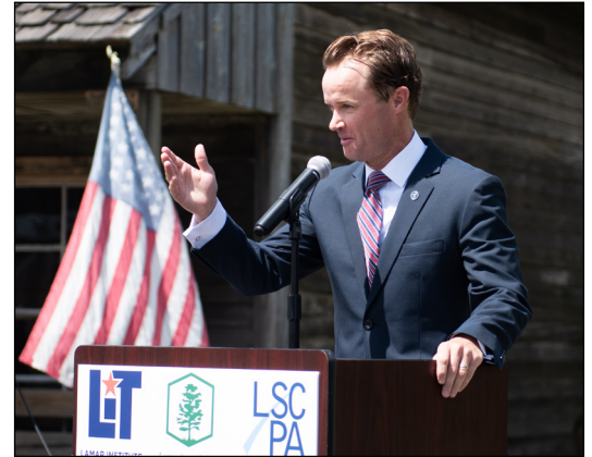
Representative Dade Phelan played an integral role in securing funding for the TSUS.