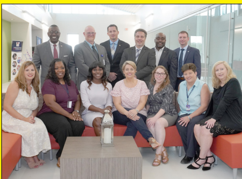
LIT and construction leadership at Eagles' Nest.

July 26, 2018, marked the groundbreaking. The total cost of the project including demolition was $7,417,590.