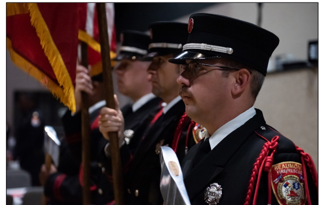
Beaumont Fire and Rescue Department Color Guard raises flags.