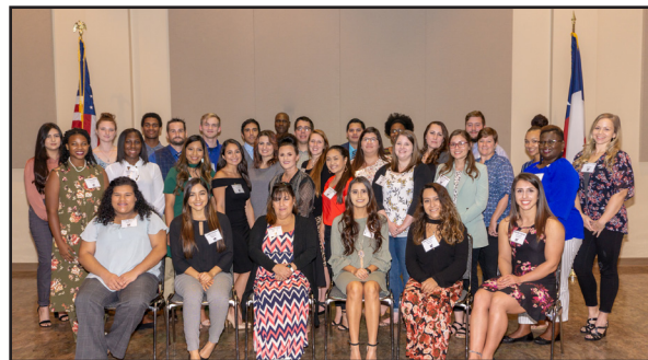
Recipients of the 2018-19 Smith-Hutson Scholarship.

Since its inception at LIT in 2014, the Smith-Hutson Scholarship Program has issued 274 scholarships to 107 LIT students for a total of $867,600. Twenty four of those recipients have graduated in four years.