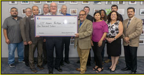
Hispanic Heritage Scholarship Committee