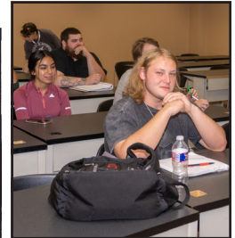
Students in speech class