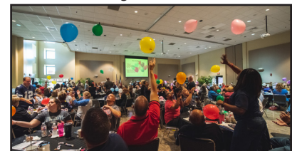
LIT employees enjoy interactive training.