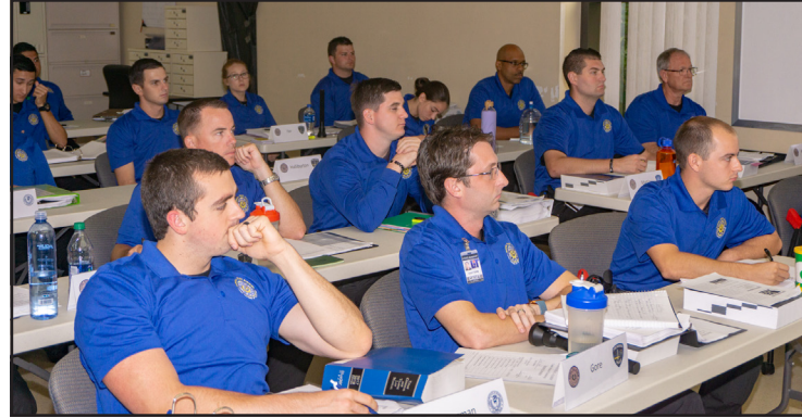
Police Academy class