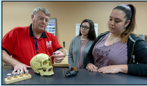
Students learn crime scene investigation.

For tickets, information on sponsorships available, or to make first responder/military reservations, visit http://www.lit.edu/foundation/Salute or call 409-880-2379.