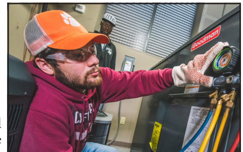
LIT's top of the line HVAC training facility.

Thanks to a $123,200, state-funded National Dislocated Worker Disaster Grant and the Texas Workforce Commission, LIT will be offering courses in HVAC and OSHA 30 for workers displaced by Harvey.