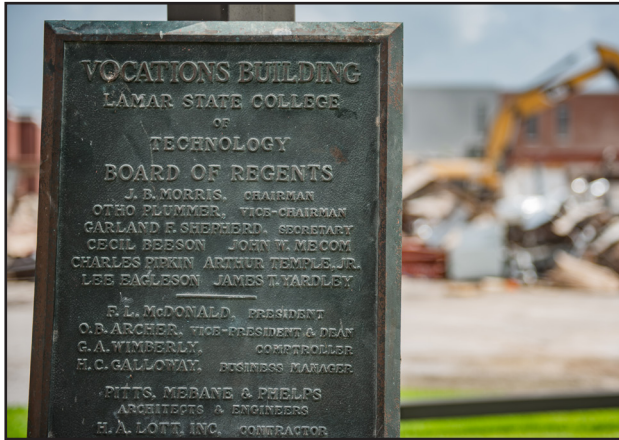
The original dedication plaque from the 1959 building dedication.