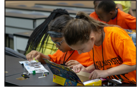
Students build robots at the STEM Camp.