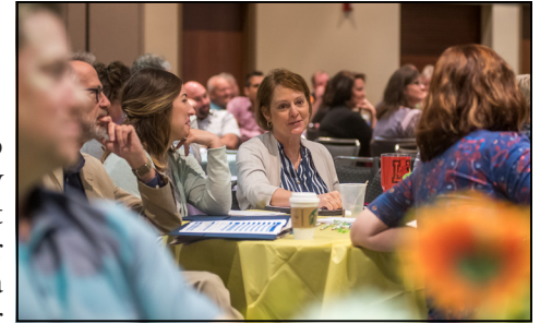
Entertaining activities are set for Opening Day 2018.

Exciting, fun and big changes have been prepared to make Fall Convocation unlike any other Opening Day held at LIT. Festivities will start at 8 a.m. on August 21 in the Paul & Connie Szuch Multi-Purpose Center Conference Room for all employees. Do you have a favorite sports team? If so, you are invited to wear your team gear, as the theme of Teamwork & Success will be highlighted by interactive presentations and hands-on training.