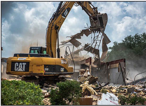
Demolition of the T1 building begins.