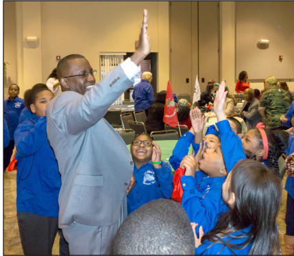
Black History Month Program