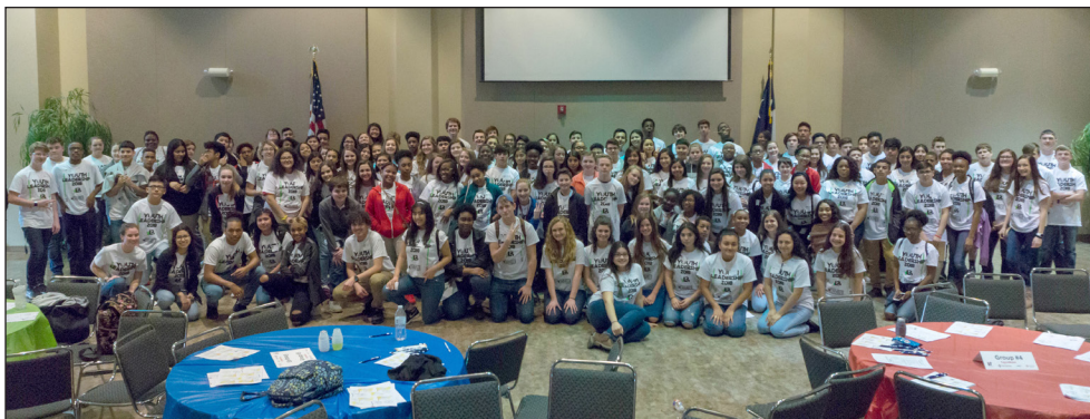
Beaumont Chamber of Commerce Leadership Conference