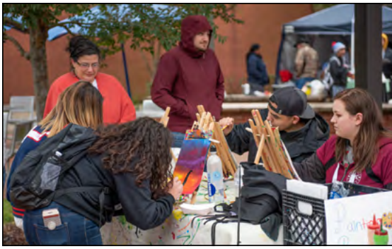
Students gather for activities in the Quad to help fight symptoms of depression.