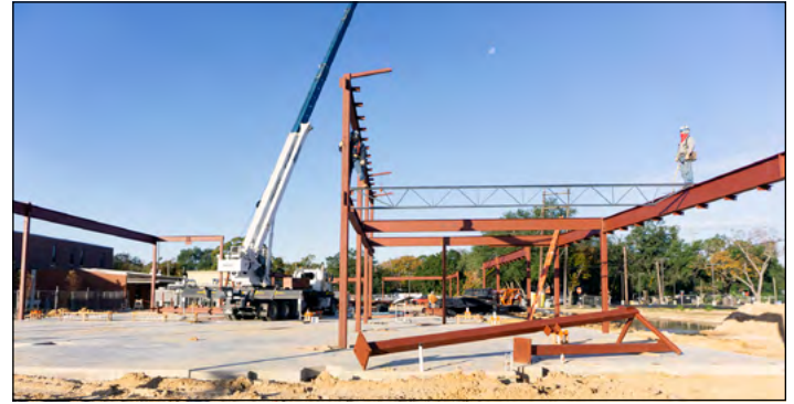
Construction workers install the frame on the new Student Services Building.