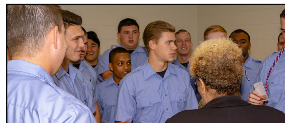
Fire Academy Cadets are ready to see their hours of training, studying and hard work pay off as they graduate.