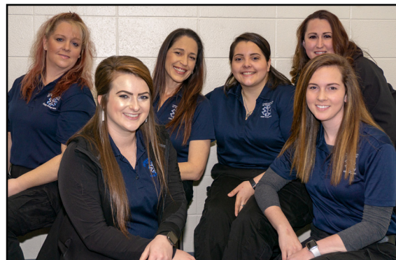
Emergency Medical Technician (EMT) Paramedic students prepare to walk the stage at graduation.