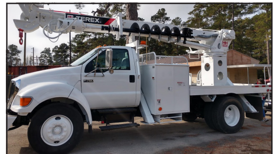
This new utility truck will assist students in reaching their goals of becoming certified linemen.