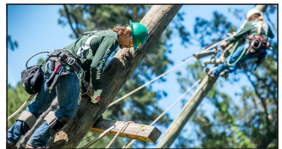
Over 100 scholarships have been made available to linemen students since 2011 thanks to $132,850 in donations.

The program was also able to purchase a new utility truck thanks to $45,000 in Perkins Fund allocations.