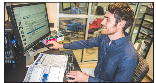
LIT is proud to offer affordable tuition to students.

The Medical Billing & Coding School has been named one of the country's 100 most affordable programs, according to MedicalFieldCareers.com in the most recent accolade for our college.