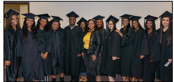
LIT Nurse Aide graduates get ready to go from the waiting room to the ceremony on the arena floor.