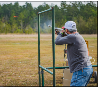
Teams did their best to hit the moving targets on the course.