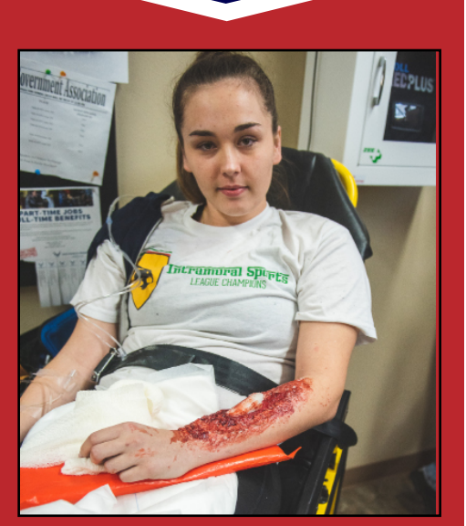
Allied Health and Sciences pulled out all the stops for students touring the MPC.