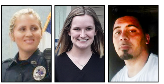
Ambassadors for their achievements and successfully overcoming barriers in their were honored at the Awards of Excellence.

Three graduates were among five who were recently recognized by Texas Workforce Solutions as the 2018 Workforce Ambassadors for their achievements and