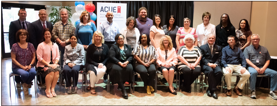
Faculty and staff from LIT, LSC-PA and LSC-O during the first collaborative ACUE Pinning Ceremony.

Faculty from each college shared how ACUE increased their classroom effectiveness.