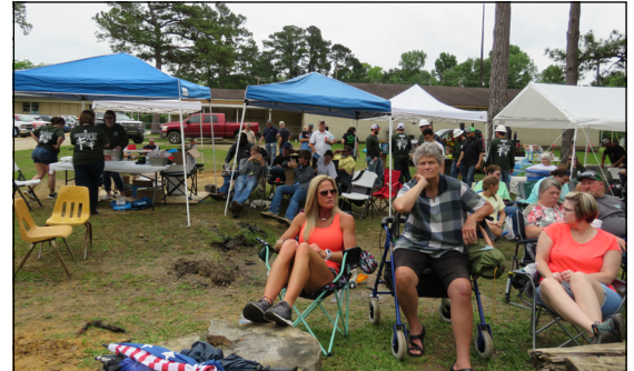
Spectators enjoyed good weather and a great competition.