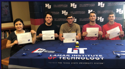
Five students from Hardin-Jefferson High proudly display their signed commitment letters.

Students from several area high schools recently signed letters of intent with LIT. Five students from Hardin-Jefferson committed to the Institute, while a ceremony at Vidor High School was in celebration of Generation Texas Decision Day, #GenTX-Day, which recognizes high school students in the college selection and enrollment process. Thirty-five seniors from East Chambers High, several from Winnie High; 14 students from Westbrook High, and two from Beaumont United also signed letters to commit. LIT is excited to help these future students achieve their career and academic dreams.