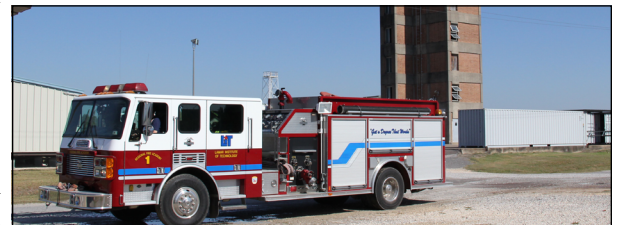
The newly constructed Regional Fire Academy is expected to open in June 2019.

The first activity at the new Fire Academy is a Kids' Fire Camp, June 3-6 and June 10-13. The Fall 2019 semester will mark the Academy's first classes at its home base since Harvey. #TexasStrong