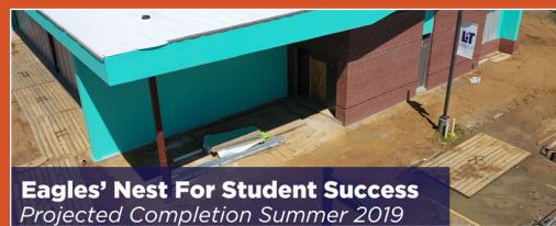
Eagles' Nest For Student Success Projected Completion Summer 2019