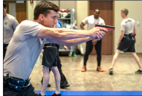
NPD announces incentive for new officers from LIT.

The Nederland Police Department announced that it will pay for training at LIT's Regional Police Academy for four future officers. The announcement came via the Associated Press (AP) on the heels of LIT's posting dates for entrance exams starting in June.